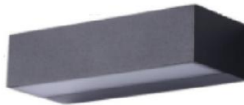
Unfixed wall Board

.It is not possible to install the wall light above high temperature object.